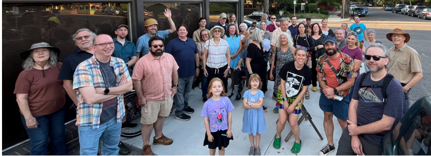
SGNA and ICA (Irvington) members at the Broadway Pave and Paint walk presented by NEEBA and PBOT on Sep 23, 2024

Welcome to Sullivan's Gulch! If you live between Lloyd Center and New Seasons, Broadway and I-84, then you are a member of Sullivan's Gulch Neighborhood Association (SGNA)!